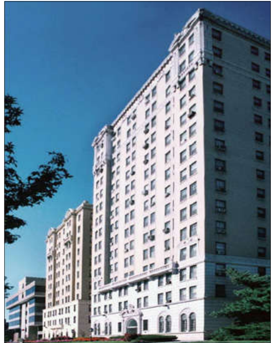
The President Apartments and Park Royal Apartments. Bianco acquired these classic St. Louis apartment towers in 1973 and 1995.

We have worked hard to build a reputation in the real estate community as knowledgeable investors who perform promptly and buy quality properties.